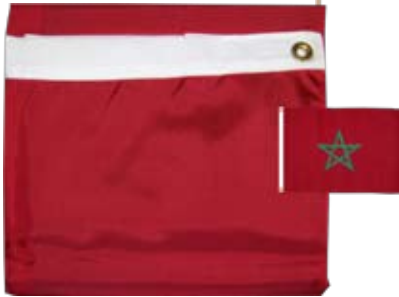
Flag, Outdoor Moorish, Nylon, 3' x 5' has Canvas Heading and grommets MAN35 $58.60 ea.