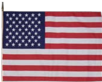
Wall Flag, Printed, U.S., Cotton, 2'x3', on Dowel USSC2436 $10.00 ea.