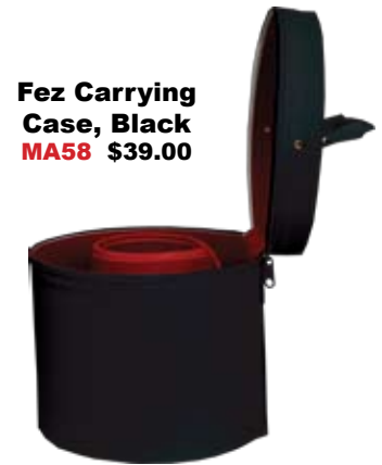
Fez Carrying Case, Black MA58 $39.00