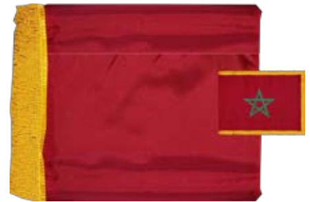
Flag, Indoor, Moorish, Nylon 3' x 5", has Pole Hem with Fringe MAPH35 $85.00 ea.