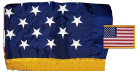
Flag, Indoor, U.S., Nylon 3' x 5", has Pole Hem with Fringe USPH35 $65.50 ea.