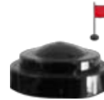
Base to hold one Stick Flag MA16B $1.50 ea.