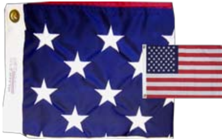
Flag, Outdoor U.S., Nylon, 3' x 5' has Canvas Heading and grommets USN35 $39.30 ea.