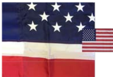
Flag, Indoor, U.S., Nylon, 3' x 5", has Pole Hem USPH35NF $55.60 ea.