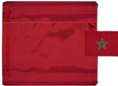
Flag, Indoor, Moorish, Nylon, 3' x 5", has Pole Hem MAPH35NF $71.00 ea.