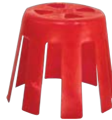
Fez Liner Red - MA55 $6.75