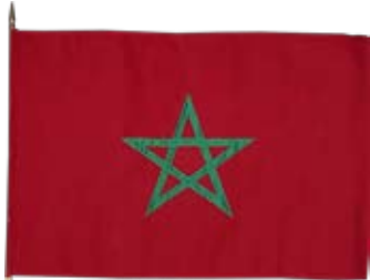
Wall Flag, Sewed Design, Moorish Cotton, 2'x3', on Dowel MASC2436 $41.10 ea.